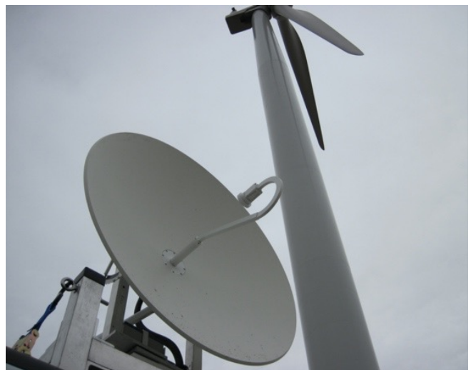
Radar antenna adjacent to a wind turbine

Developing new monitoring technology that can be deployed from a buoy would address these challenges and provide developers, regulators, and researchers with a flexible platform for collecting data on vertebrate abundance and behavior at many offshore locations without incurring the prohibitive costs of a jack-up barge or multi-season vessel surveys. With funding from the Department of Energy's Wind Energy Technologies Office, Pacific Northwest National Laboratory and the United States Geological Survey are partnering to develop a radar system capable of measuring bird and bat abundances and behaviors at offshore locations.