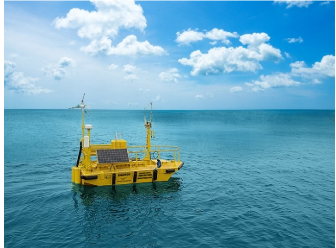
Department of Energy lidar buoy deployed off the coast of California

Pacific Northwest National Laboratory and the United States Geological Survey are working together to address these challenges and develop, validate, and deploy a radar system capable of detecting and monitoring flying animals over open water. The radar system will be integrated with one of the Department of Energy's lidar buoys for testing and deployment. The technology will be validated with auxiliary measurements from thermal cameras , acoustic monitors, weather radar (NEXRAD), and human observers. Ultimately, the technology aims to produce a radar and buoy system capable of monitoring bird and bat activity above open water and demonstrate its performance by collecting pre-construction monitoring data in the Great Lakes.