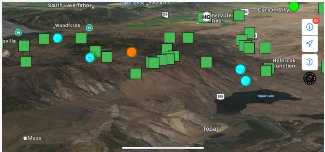
Locations of interagency resources viewed in the iTAK app.

Public safety agencies can now access the Team Awareness Kit (TAK) application on both Apple and Android devices. TAK is a geospatial mapping platform and common operating program that uses a mobile device's GPS to track a user's location, while displaying the locations of others for enhanced situational awareness. In April, the U.S. Department of Homeland Security (DHS) Science and Technology Directorate announced the iOS iTAK app is now available on the Apple App Store. The Android version of TAK (or ATAK) is already available and has supported hurricane relief, firefighting, national security events, and public safety operations. See the press release to learn more.