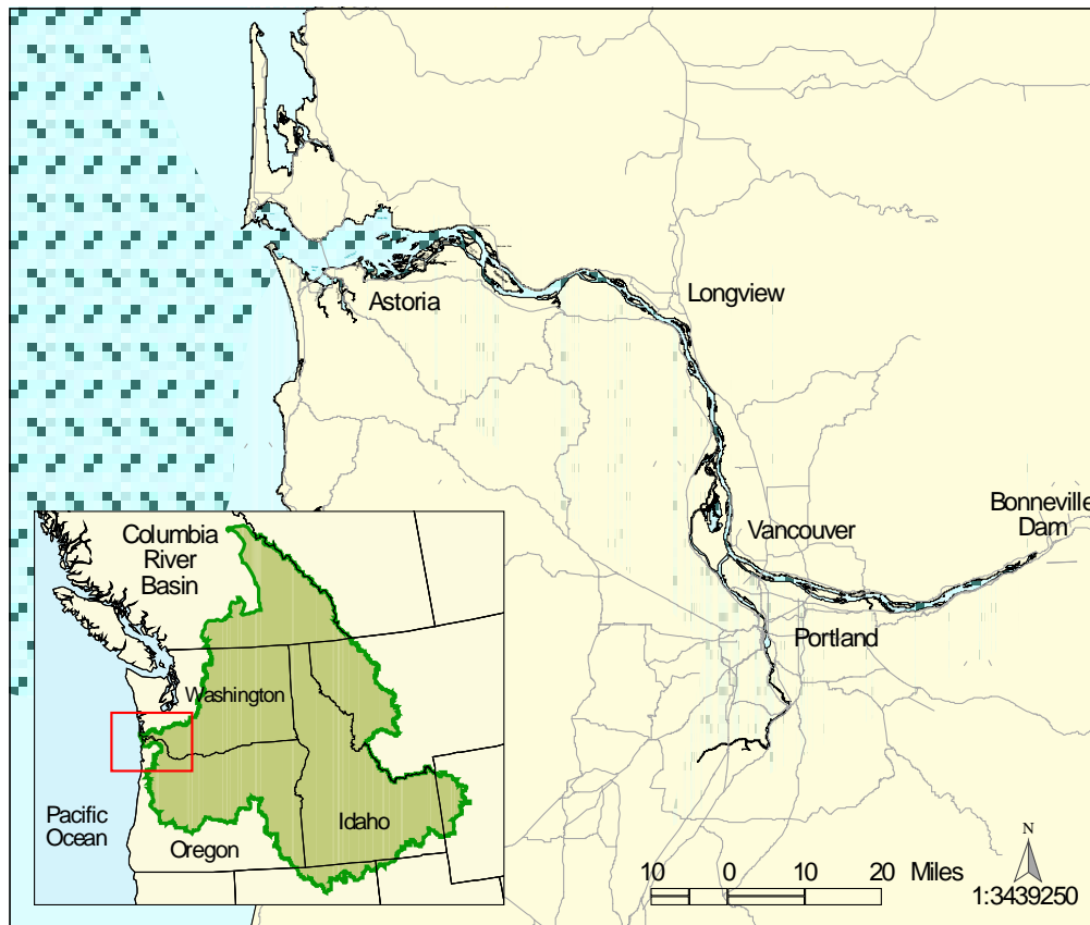
Figure 1. The Location of the Columbia River Estuary. The estuary includes the main stem, tidally influenced waters from Bonneville Dam down through the lower river and estuary into the river's plume in the ocean.

This document is the annual report for fiscal year 2010 (FY10) for the project called Facilitation of the Estuary/Ocean Subgroup (EOS). The EOS is part of the research, monitoring, and evaluation (RME) effort developed by the Action Agencies (Bonneville Power Administration [BPA], U.S. Army Corps of Engineers [Corps or USACE], and U.S. Bureau of Reclamation) in response to obligations arising from the Endangered Species Act as a result of operation of the Federal Columbia River Power System (FCRPS). For the purposes of this report, the Columbia River estuary includes main stem waters from Bonneville Dam down through the lower river and estuary into the river's plume in the ocean (Figure 1).