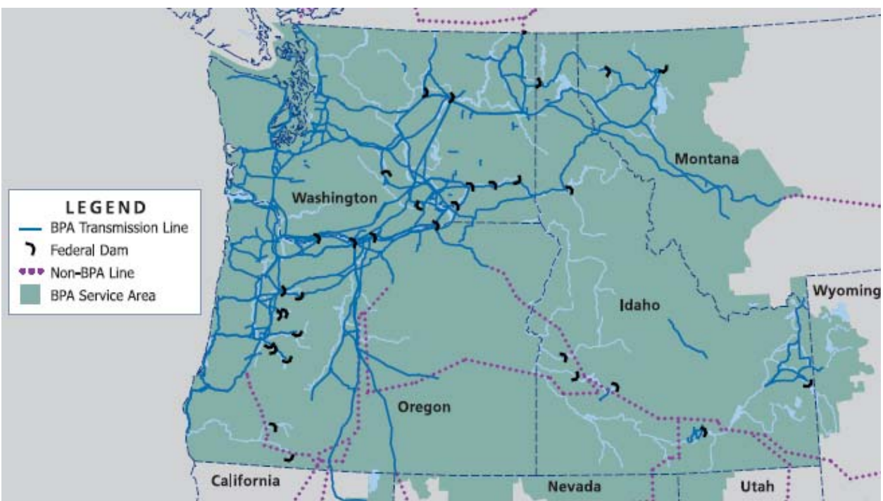
Figure 1. The BPA Service Area with Transmission Lines and Federal Dams<sup>i</sup>

The primary purpose of the RIM is to evaluate the impacts of variable output renewable generation on the bulk electric power system in the presence of a complex complementary systems such as hydrological systems, wind generation systems, solar photovoltaic systems, and energy storage systems. The single simulation environment will combine power system tools such as unit commitment, economic dispatch, load following, regulation and reserves with meteorological tools such as meso-scale wind models. Initially the RIM will be applied to analysis of the BPA operating area shown in Figure 1. This will include power system models of the infrastructure within the BPA service area, models of the hydrological system, as well the necessary meso-scale wind databases. The RIM can in principle be applied to any region as long as the necessary datasets and computational resources are available.