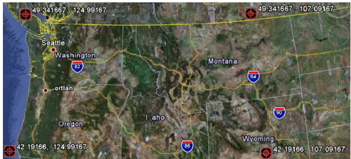
Figure 4. Area covered by 3Tier wind data (corners indicated by

The RIM must then read these files and interpolate to one minute while summing the power of all sites in the same zone, resulting in a netCDF file that contains array with a column for each zone and a row for each minute of the year being simulated. The interpolation program provided by 3Tier uses a different probability distribution function for large farms (>20 turbines) and small ones.