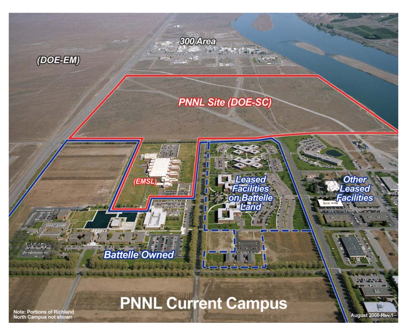
Figure 1.1 Location of the Department of Energy's PNNL Site

Of these five buildings, only the 3410, 3420, and 3430 buildings will house processes that use dispersible radioactive materials. Radioactive Air Pollutants NOC applications for these three buildings are prepared in accordance with WAC 246-247 and submitted to WDOH for review and approval. EMSL has previously been exempted from obtaining an NOC. Figure 1.1 shows the location of the PNNL Site and the Hanford Site 300 Area.