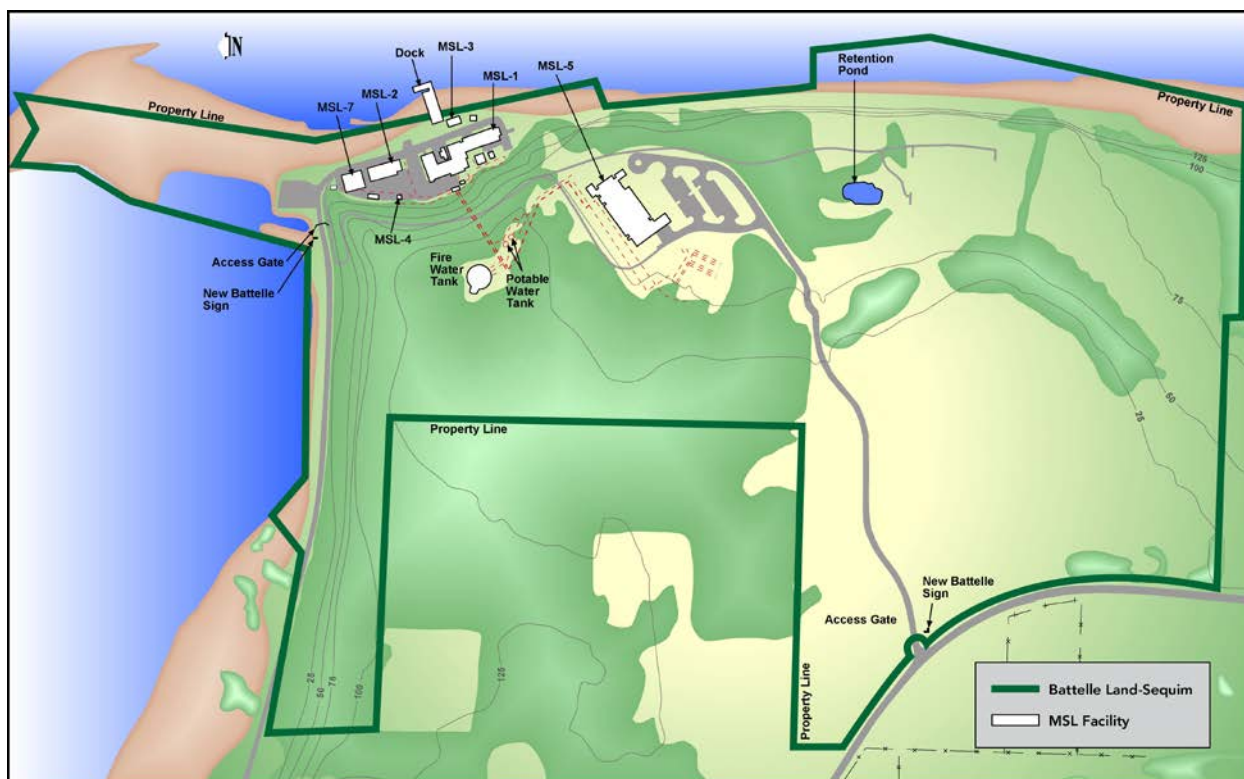
Figure 1.2. Battelle Land-Sequim and Marine Sciences Laboratory

Battelle Land-Sequim on Washington State's Olympic Peninsula is the site of DOE's only marine research laboratory. It lies on the shores of the Strait of Juan de Fuca and is in the rain shadow of the Olympic Mountains in Clallam County at approximate coordinates 48°04'40" N, 123°02'55" W. Despite its coastal location, it receives less than 15 inches of rainfall on average annually. Average monthly temperatures range from 31°F to 70°F. Nearby cities are Sequim (population 6,600), Port Angeles (population 19,000), and Port Townsend (population 9,100) (DOC 2011). Seattle is approximately 50 miles (mi) from MSL. The nearest sea border with Canada is about 17 mi from MSL in the Salish Sea; the nearest Canadian land border is about 25 mi northwest from MSL.