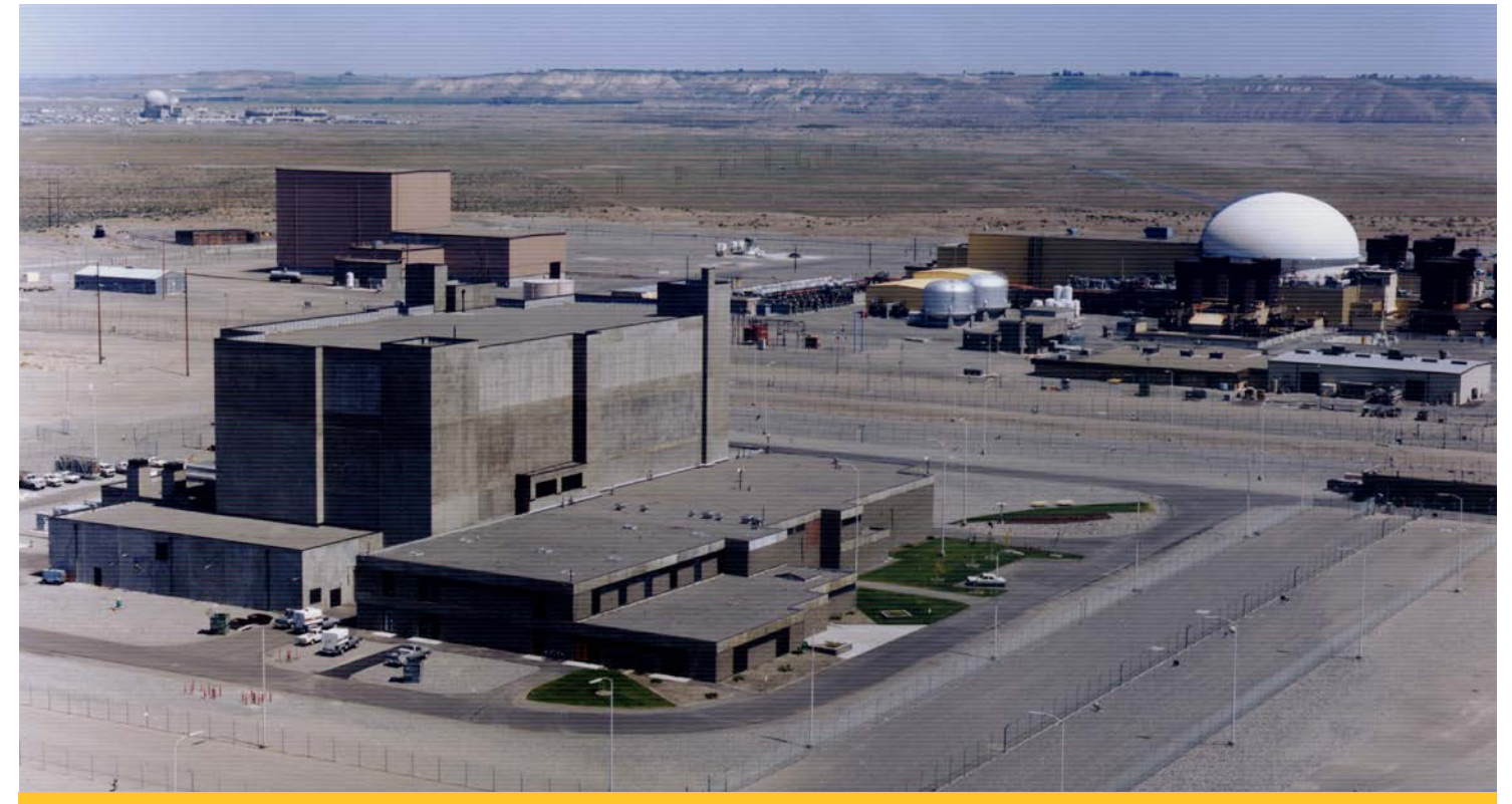
Fuels and Materials Examination Facility adjacent to FFTF, a few miles north of PNNL